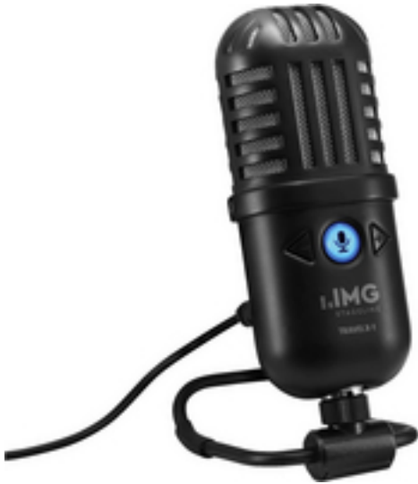
TRAVELX-1 Frequency Response